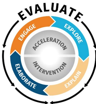
Five E + IA Instructional Model

Members of the Alabama State Science Course of Study Committee and Task Force support the use of inquiry-based instructional models such as the following Five E + IA Instructional Model.* This model complements the three-step planning process described on the preceding page.